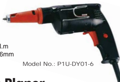
Model No.: P1U-DY01-6