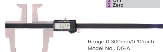
Range: 0-300mm/0-12inch Model No.: DG-A