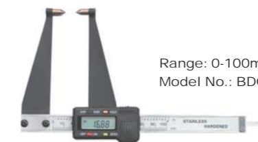
Range: 0-100mm/0-4inch Model No.: BDG-C