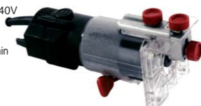
Model No.: M1P-DY03-6