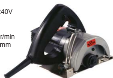
Model No.: Z1E-DY02-110