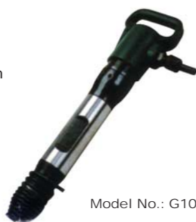
Model No.: G10