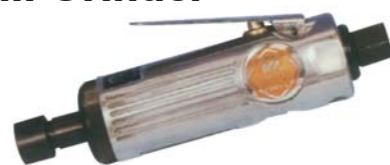
Model No.: DG-3/8