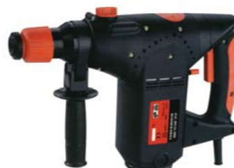
Model No.: Z1C-DY32-30D