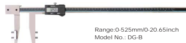
Range: 0-525mm/0-20.65inch Model No.: DG-B