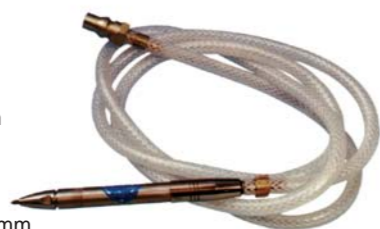
Model No.: ES