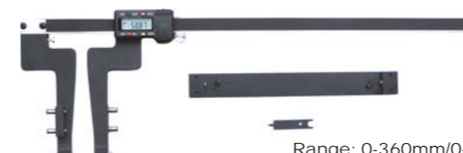
Range: 0-360mm/0-14inch Model No.: DG-C