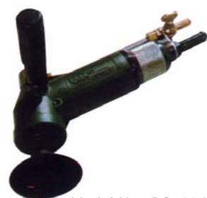
Model No.: PG100J100S