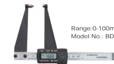
Range: 0-100mm/0-4inch Model No.: BDG-B