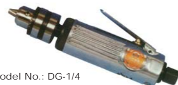
Model No.: DG-1/4