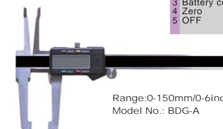
Range: 0-150mm/0-6inch Model No.: BDG-A