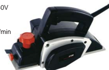
Model No.: M1B-DY01-80(82)X1