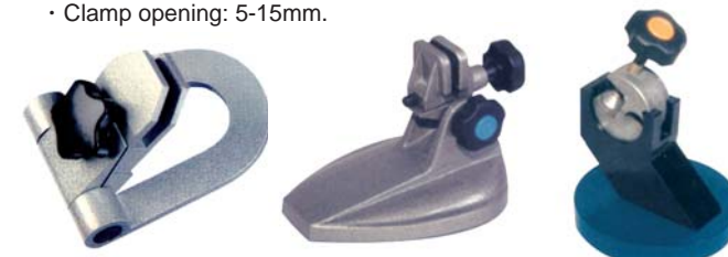
Model No.:MS-1 Model No.:MS-2 Model No.:MS-3