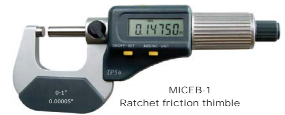
MICEB-1 Ratchet friction thimble