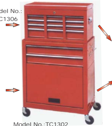
Model No.:TC1302 3"x1" casters

*Top chest can be put into roller cabinet in transportation