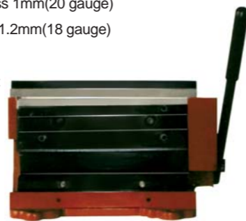
Model No.: 371010