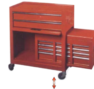
Model No.:TC13062 (TC1306+TC1302)

*Top chest can be put into roller cabinet in transportation