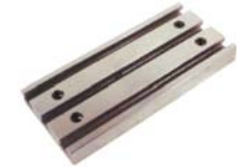
Model No.:Mill table