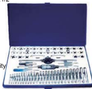
Model No: TDS-60