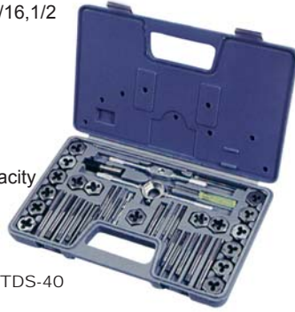
Model No: TDS-40