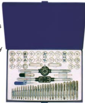
Model No: TDSM-58