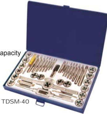
Model No: TDSM-40