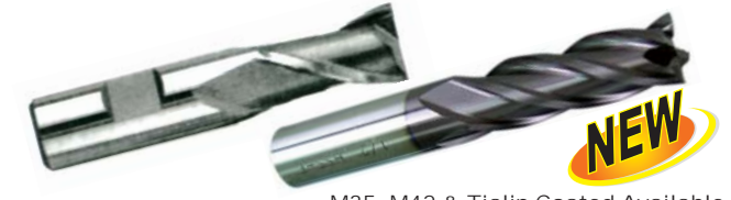
M35, M42 & Tialin Coated Available