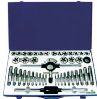
Model No: TDSM-45