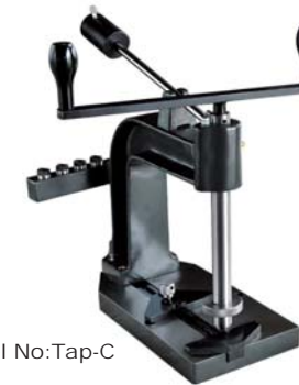
Model No: Tap-C