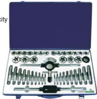
Model No: TDS-45