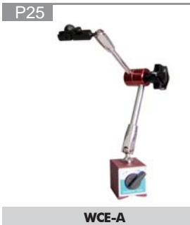
UNIVERSAL ON-OFF MAG.BASE HOLDERS