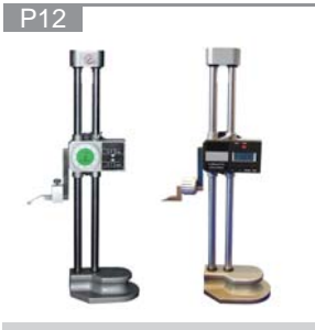
HGTC-12 HGTCE-12 HEIGHT GAGES