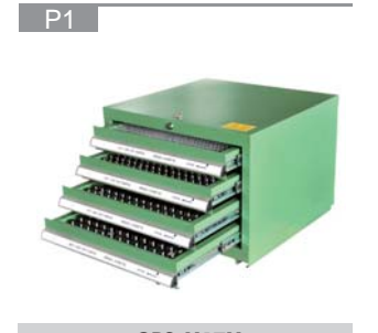
GPS-M17M PLAIN PLUG GAGES LIBRARY SERIES