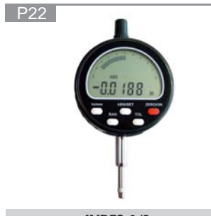
INDES-1/2 DIGITAL DIAL INDICATOR