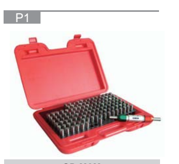
PLAIN PLUG GAGES