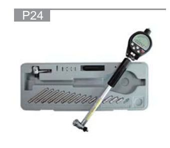
DBGES5 ELECTRONIC BORE GAGE