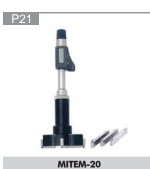
IP54 ELECTRONIC THREE-POINT INTERNAL MICROMETERS