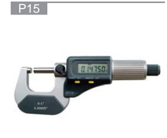
MICEB-1 IP54 ELECTRONIC OUTSIDE MICROMETERS