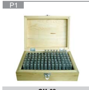
PLAIN PLUG GAGES DIN 2269