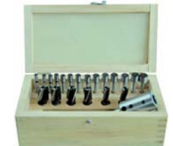
CPIS-31 COUNTERBORE SET