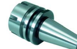
TOOLING 7:24 COLLET CHUCK ER