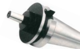
CAT40, CAT50 V-FLANGE DRILL CHUCK ADAPTERS