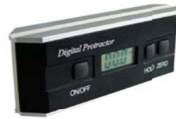
DP360 DIGITAL PROTRACTOR