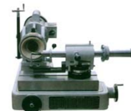
M6020 CUTTER MASTER-END MILL SHARPENER