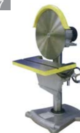
DSNW-20 20" DISC SANDER