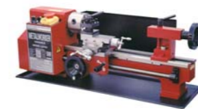
ML200 MINI LATHE