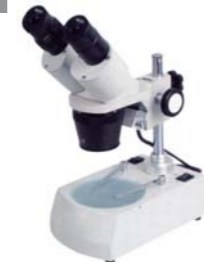
XTD-3C STEREO MICROSCOPE