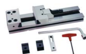
VGS-4 MODULAR PRECISION GROUND VISES