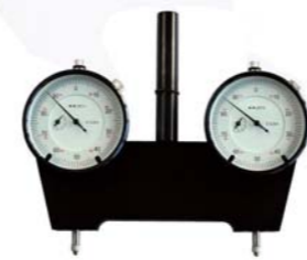
SPQ SPINDLE SQUARE