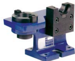
ETTF-40CAT HORIZONTAL-VERTICAL TIGHTENING FIXTURES