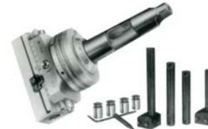
F212A UNIVERSAL FACING AND BORING HEAD