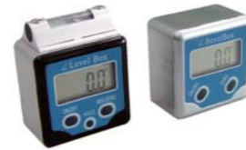
BEBL, BEB BEVEL BOX