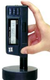
TH132 INTEGRATED POTABLE HARDNESS TESTER