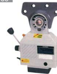
PF-Y POWER FEED