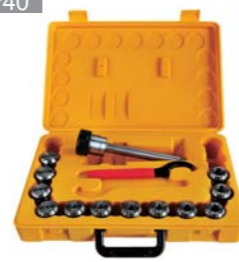
ER COLLETS SETS