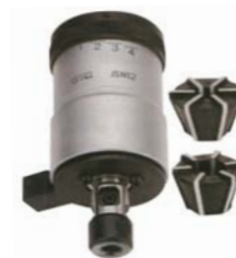
TH-30 REVERSING TAPPING HEADS & ATTACHMENTS