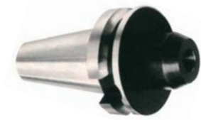
CAT40/CAT50 END MILL HOLDERS