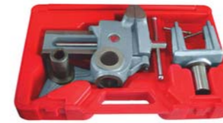
VKS QUICK VISE