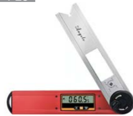
AFD DIGITAL ANGLE FINDER