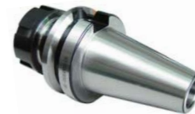
ER PRECISION COLLET CHUCKS