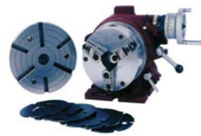
ISR-8 INDEXING SPACERS