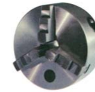
LCF3J-3R FLAT BACK LATHE CHUCKS