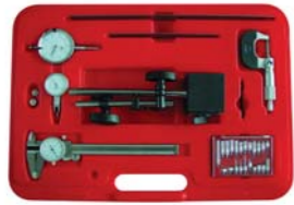
TK-6 6 PIECE MACHINIST SET