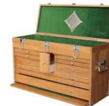
TC52 TOOL CHEST