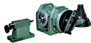
UDH-4 UNIVERSAL DIVIDING HEAD