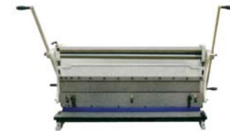
371004 3-IN-1 COMBINATION SHEAR, BRAKE & ROLL