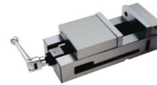
VISCNC-6 PRECISION CNC MACHINE VISE